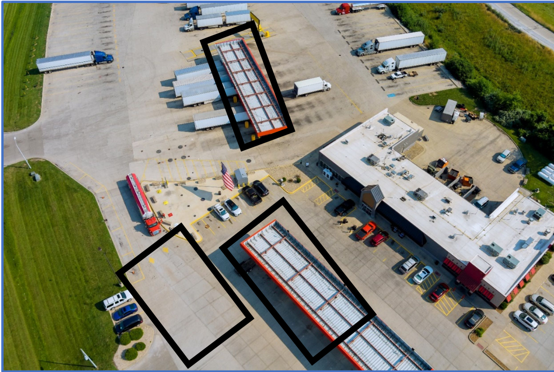
Boxes indicate location of underground storage tank and fuel dispensers being installed.