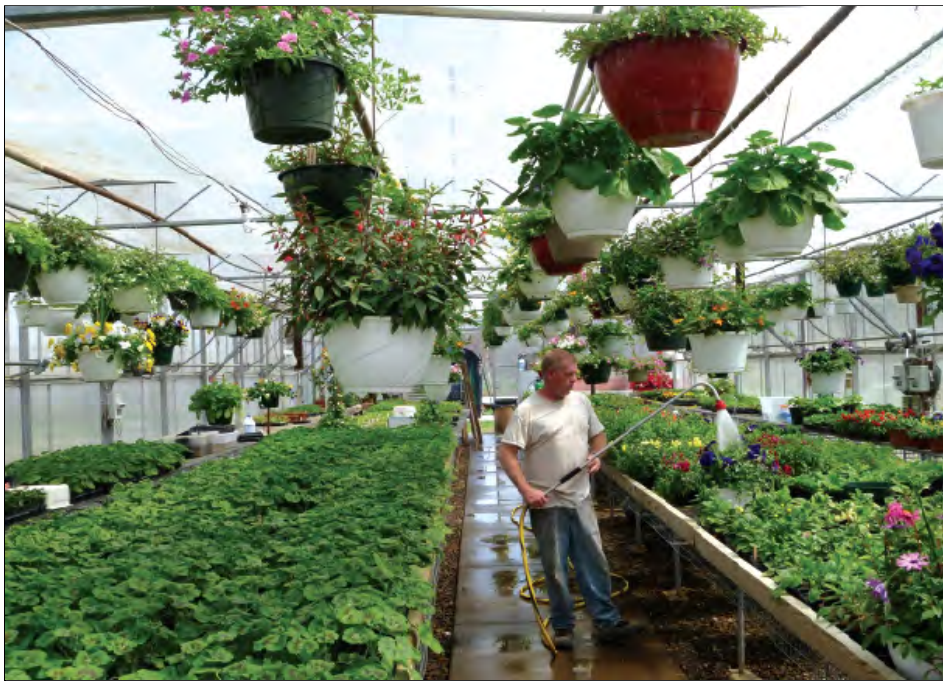
The greenhouse at the Villa Maria convent farm is just a small part of the convent's ag operation in western Pennsylvania. The farm is a member of the Lake-to-River Food Cooperative in Youngstown, Ohio.

In June 2014, the topic was renewable energy in Germany, and how many of its “green initiatives” have not gone as hoped.