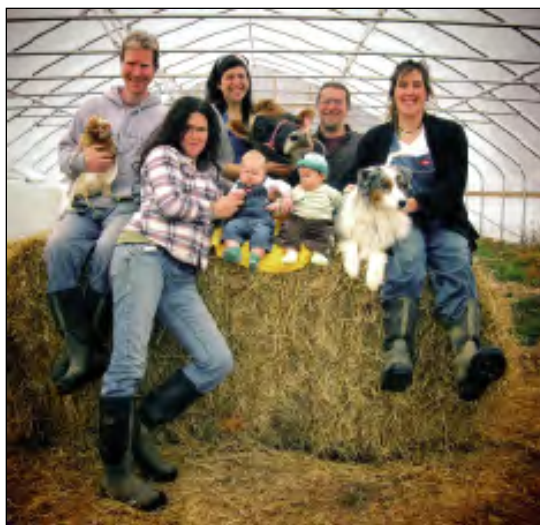
Blackberry Meadows Farm was first certified organic in 1992 and has since provided the Pittsburgh area with high-quality, local fruits and vegetables, meats and eggs. The farm joined the Penn's Corner co-op in 2013.

The B&I program is available on a rolling basis throughout the year and can finance local food enterprises in both rural and urban communities. To learn more, contact your local USDA Rural Development office, which you can reach, toll-free, by calling: 1-800-670-6553, or visit: www.usda.rurdev.gov . ■