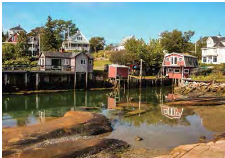
Deere Isle, Maine, is the home of one of the nation’s newest worker cooperatives, formed last year to help preserve 65 jobs and maintain businesses that are crucial to the local economy.