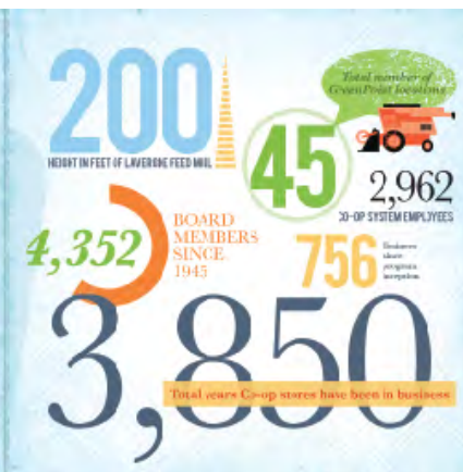
Tennessee Farmers Cooperative won “publication of the year” honors for “The Sum of Us,” which includes the financial information typically found in an annual report, along with other information that makes it a striking “identity” publication for the co-op.