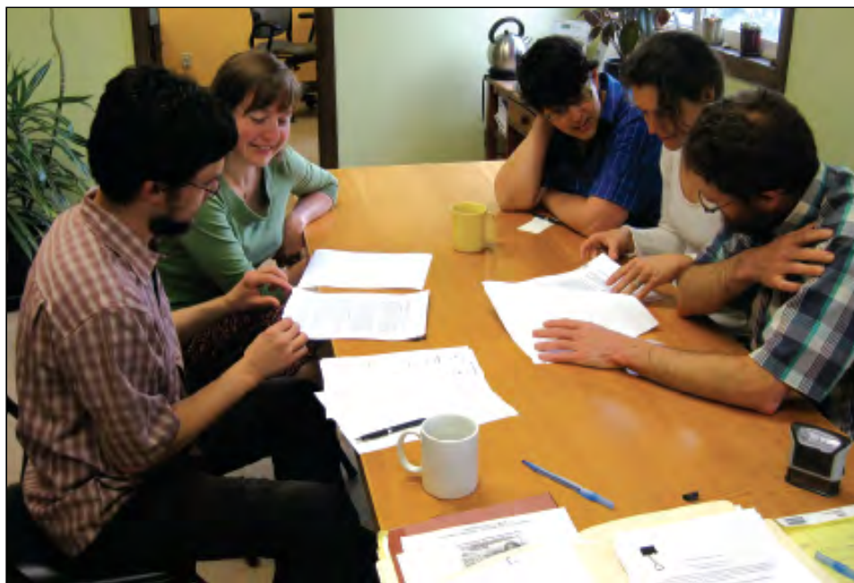
As they look to their second year as a co-op, members are working to anticipate the systems needed to become better business owners.

and other businesses that carry our products, the people who purchase them, the investors who helped finance our transition, and the co-ops that have supported us along the way — as we