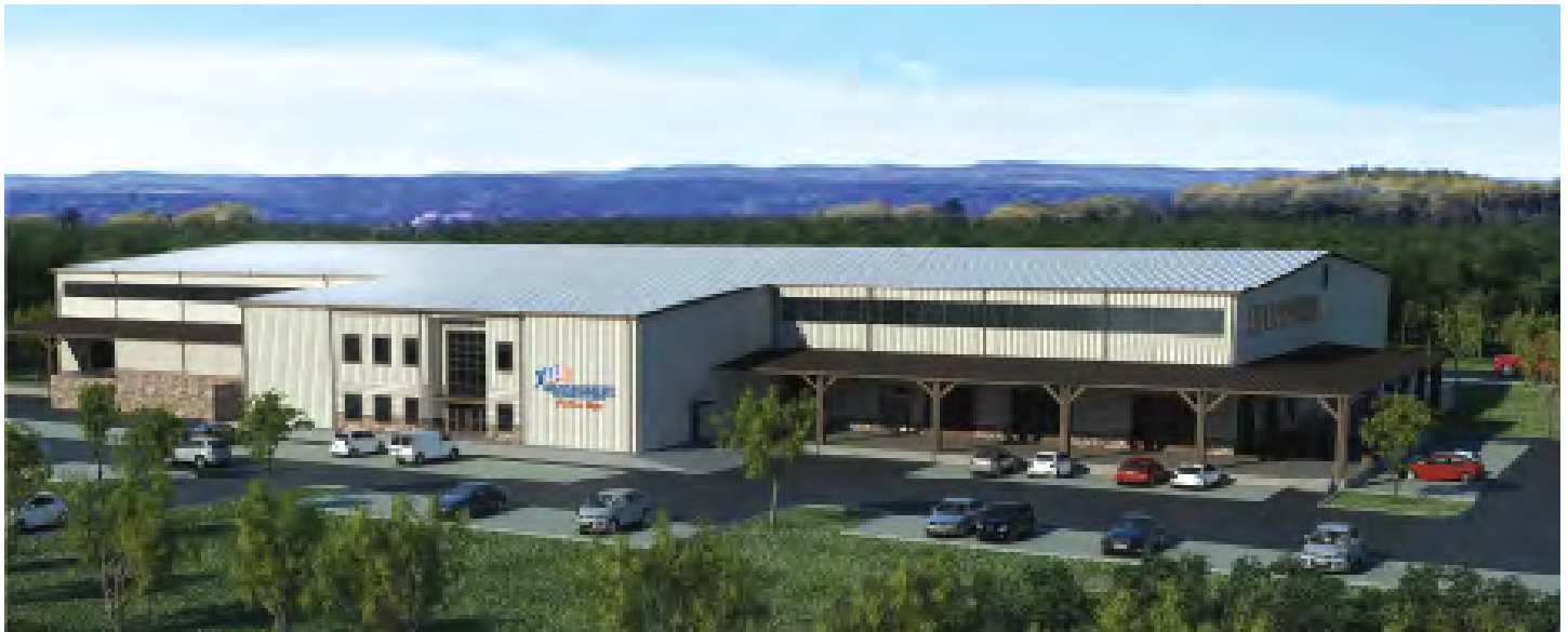
Second Harvest's new, 65,000-square-foot regional food distribution center in Thomasville, Ga., benefitted from $5.2 million in funding from USDA Rural Development.