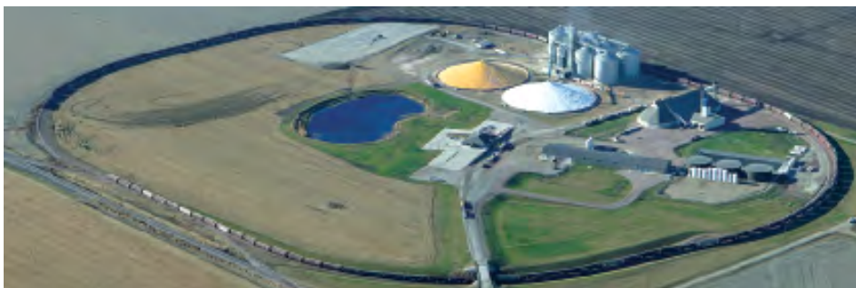
The East Hub facility of Nebraska's Central Valley Ag Cooperative (CVA), which will merge with United Farmers Cooperative, effective Sept. 1. The merged co-op would have ranked as the nation's 21st largest ag co-op last year.

The Upper Midwest region of the program encompasses businesses based in Minnesota, the Dakotas, Iowa and Nebraska. ■