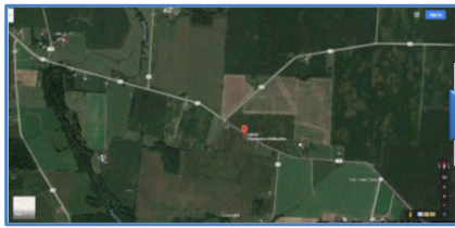
Eligible Rural Area

First Loan: Short term construction loan >>> Usually 12 months