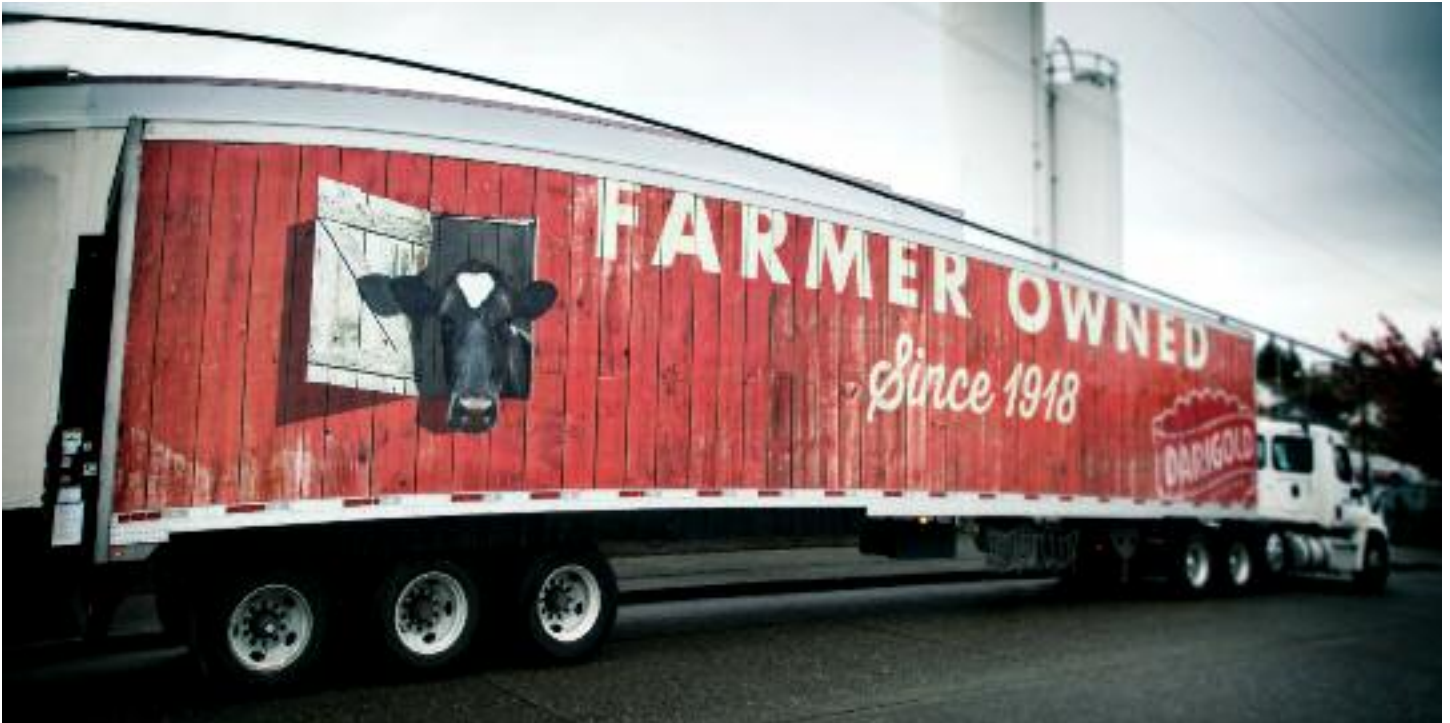
Greetings from the country — Darigold's new fleet of trucks deliver a co-op ownership message along with nutritious dairy foods.

Send co-op news items to: dan.campbell@wdc.USDA.gov