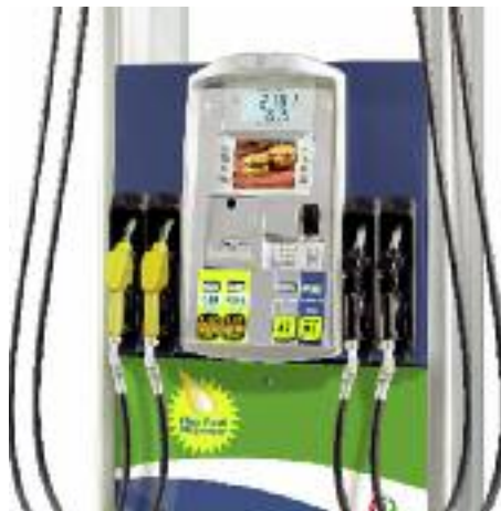
Flex fuel pumps can provide various ethanol blends.

The ethanol market will soon face worsening, slim-to-negative profit margins, which could potentially push the industry toward consolidation, according to a new report from CoBank’s Knowledge Exchange