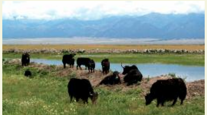
Members of Arkansas Valley Organic Growers celebrate another grand day for farming in southern Colorado. Below, beef cattle being raised for the Valley Roots Food Hub. Both hubs are members of the Tap Root Cooperative.

they agreed the best way to proceed was “to start small.”