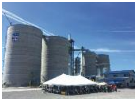
This new, $25 million grain facility was built through a joint venture of the MFA Inc. and MFA Oil cooperatives.

The facility — which will be operated by MFA Inc. — will benefit from resources and expertise of both