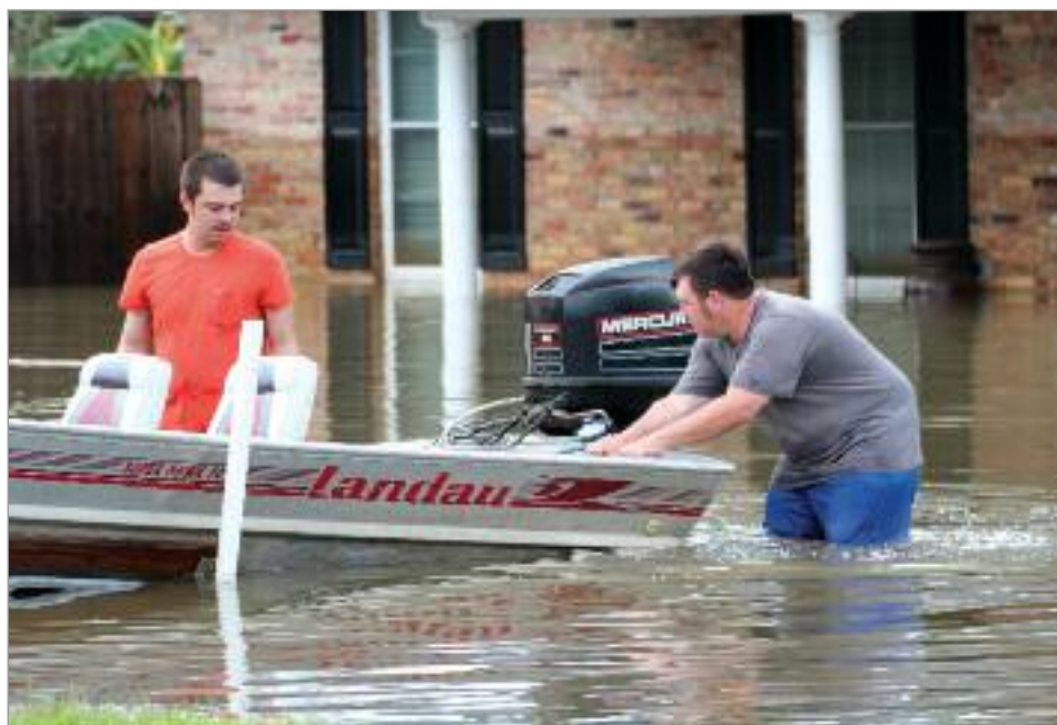
Dixie Electric Membership Corporation’s crisis plan was put to the test when the Louisiana co-op’s service territory received 30 inches of rain in three days, resulting in catastrophic flooding in August 2016.