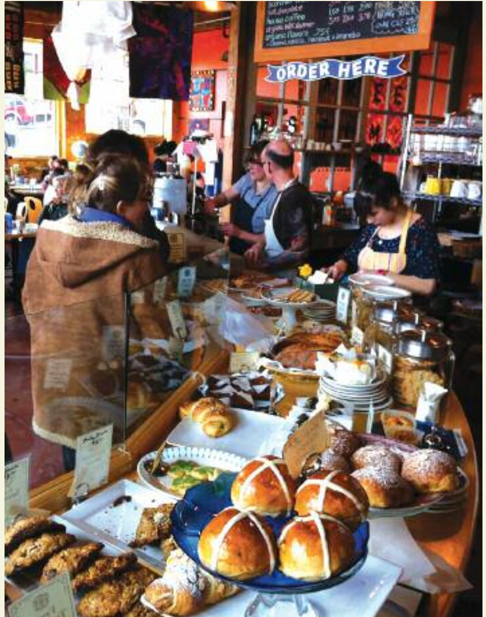
The Northwest Cooperative Development Center (NWCDC) learned about dynamic governance from two of its Oregon cooperative clients – Blue Scorcher Bakery in Astoria (seen here) and Our Table restaurant, near Portland. This model of co-op governance helps ensure that everyone's voice is heard.

This governance method operates on the basis of participation, accountability and consent. Participation through