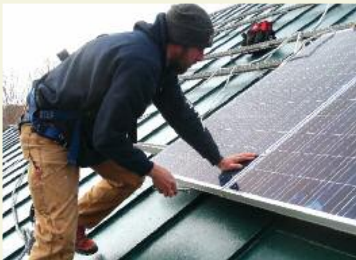
An Insource Renewables crew installs rooftop solar panels. The business is in the process of converting to a worker-owned co-op.

“They have really come together as a team and are seizing opportunity. Otherwise, they probably would’ve left town, like a lot of other kids do.”