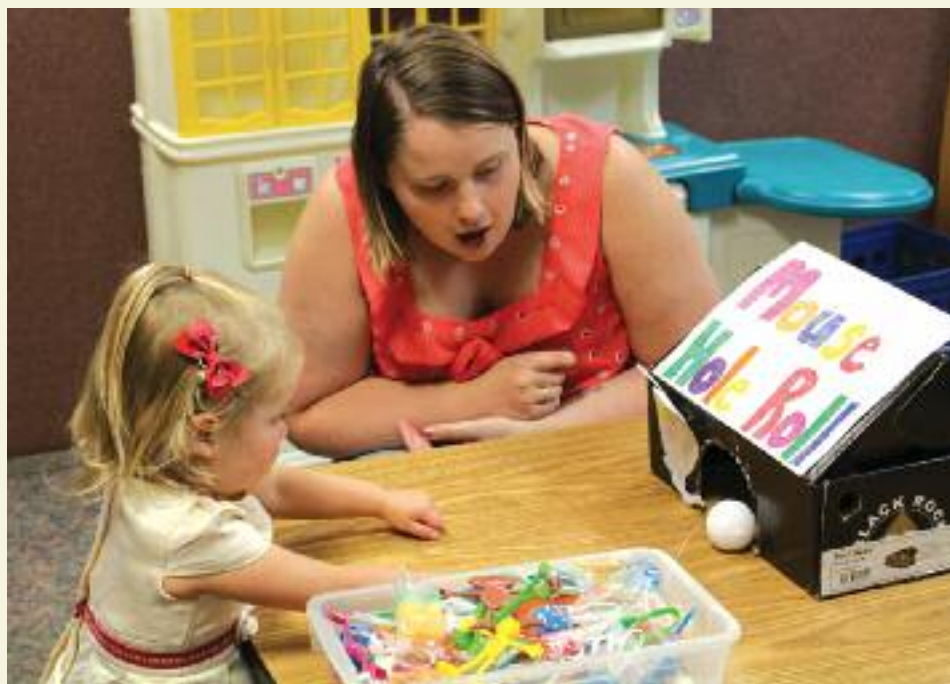
Playing and learning at the new Energy Capital Cooperative Child Care center in Hazen, N.D. The co-op can provide quality daycare for up to 77 children.