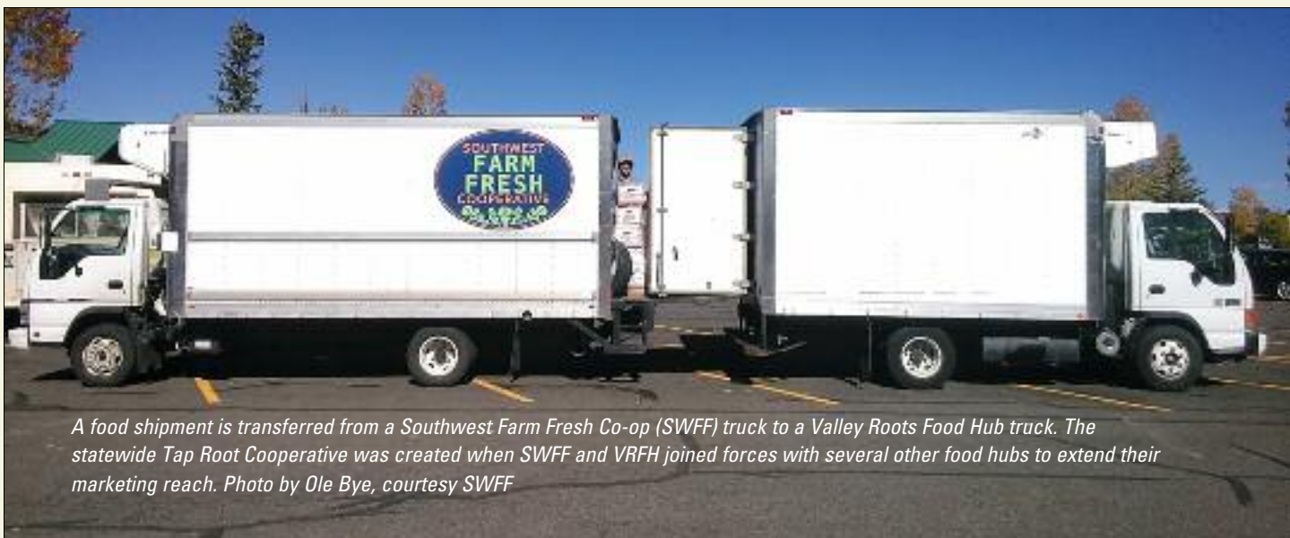
A food shipment is transferred from a Southwest Farm Fresh Co-op (SWFF) truck to a Valley Roots Food Hub truck. The statewide Tap Root Cooperative was created when SWFF and VRFH joined forces with several other food hubs to extend their marketing reach.