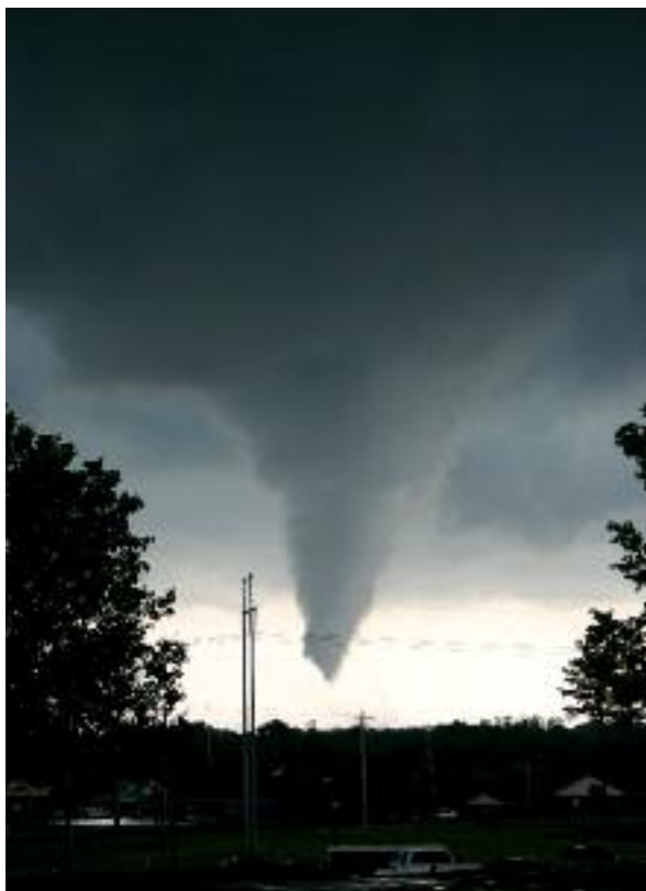
Leaders of Cullman Electric Cooperative (CEC) began rethinking their emergency readiness after a near miss by this deadly, EF-4 tornado in April 2011.

During the drill, employees put their normal jobs on hold and instead focus on their assigned crisis roles. Accountants set aside number crunching to make plans for feeding and housing mutual aid crews.