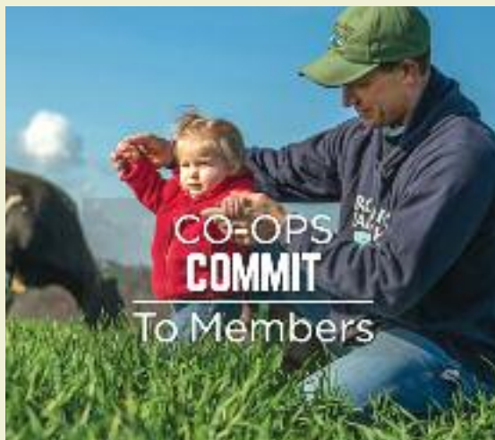
A wide variety of graphics that can be used for print, internet and social media (examples above and on the facing page), as well as sample press releases and Co-op Month proclamations, event ideas, etc., can be downloaded at: www.coopmonth.coop .

■ There are more than 40,000 cooperative businesses in the United States with 350 million members (many people belong to more than one co-op). These cooperatives generate $514 billion in revenue and more than $25 billion in wages, according to a study conducted by the University of Wisconsin Center for Cooperatives, with support from USDA Rural Development ( http://reic.uwcc.wisc.edu/default.htm ).