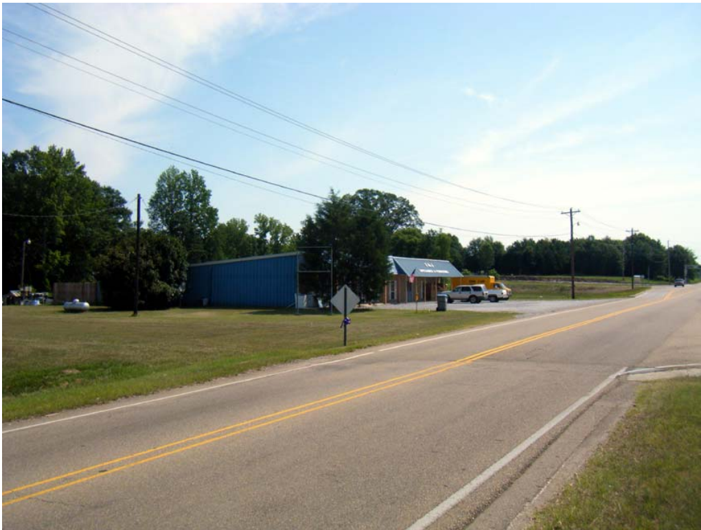
Figure 5. Standing structure, southern end of the survey area, view to the northeast.