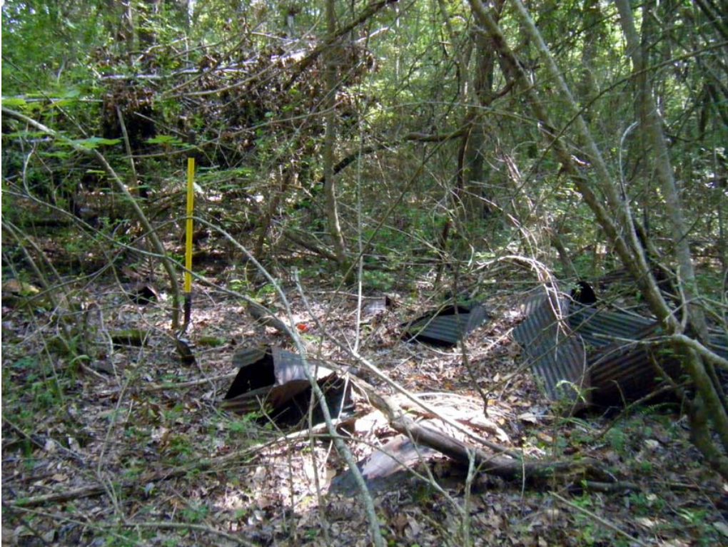
Figure 7. Roofing tin and chimney fall, 22It709, view to the northwest..