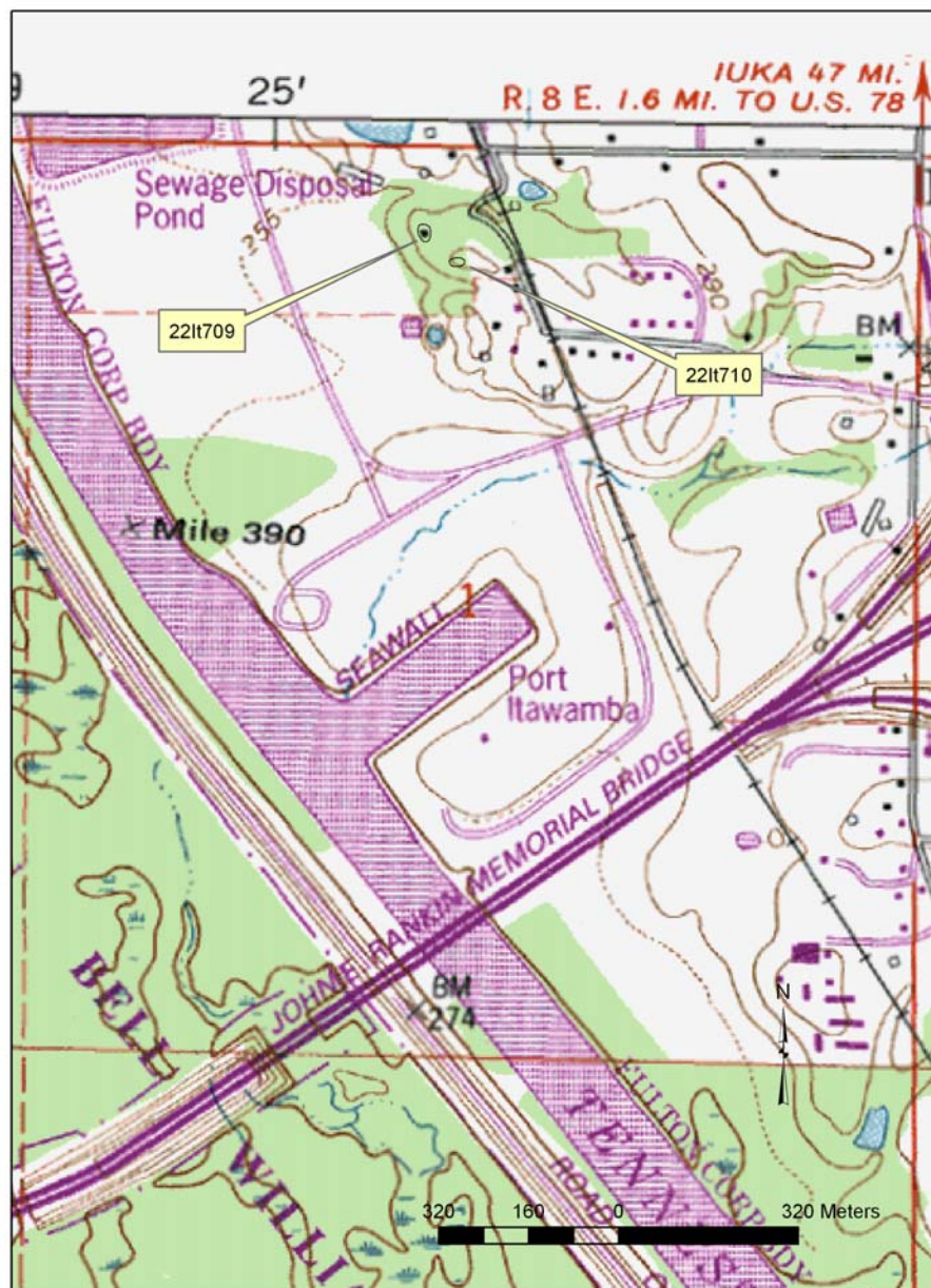
Figure 6. Locations of 22It709 and 22It710..