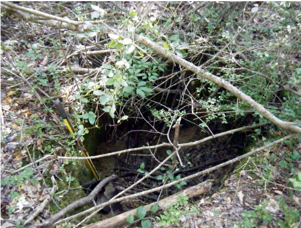
Figure 8. Possible cistern, 22It709, view to the west.