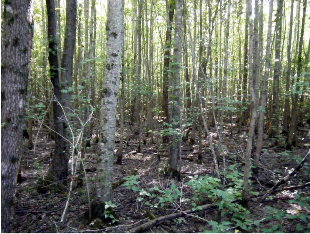
Figure 2. Flood plain tree cover in the northern two thirds of the survey area, view to the east.