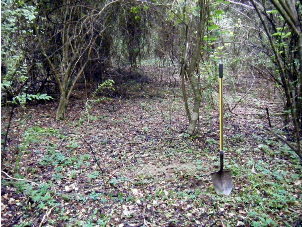
Figure 9. 22It710, view to the east.