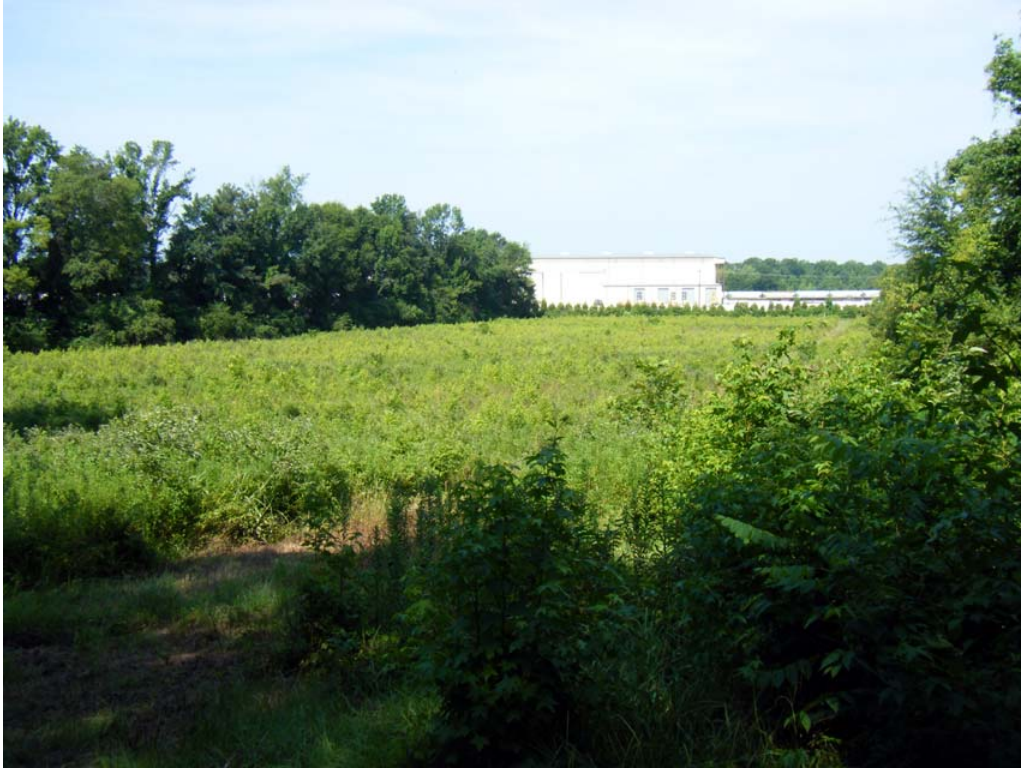
Figure 4. Flood plain ground cover in the southern third of the survey area, view to the west.