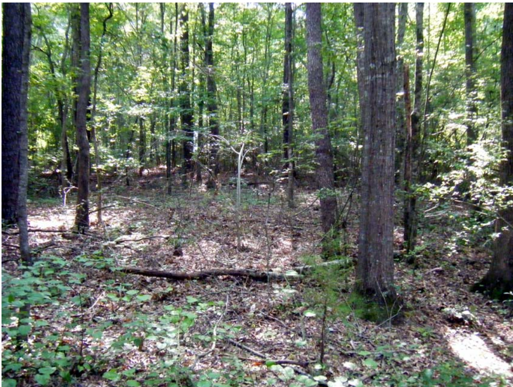
Figure 3. Upland tree cover, view to the east.