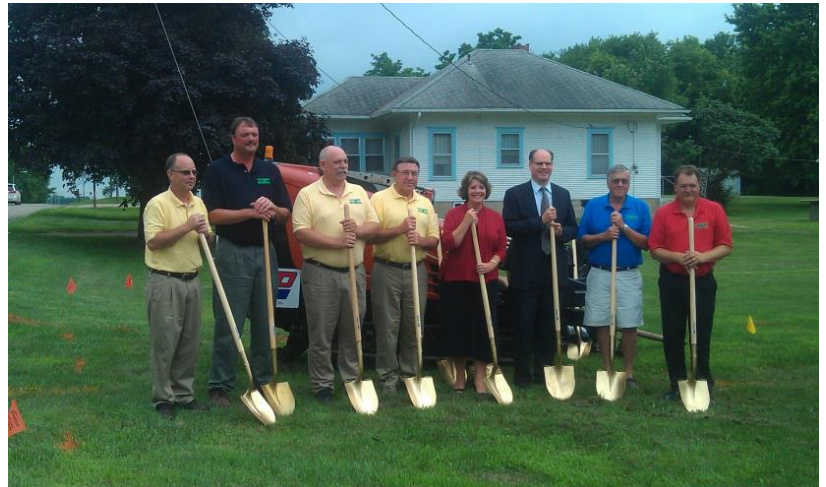
The SMBS Board welcome dignitaries to the ground breaking of their BIP project.

The Southwest Minnesota Broadband Services (SMBS) project is deploying fiber-optic infrastructure to eight rural communities throughout southwestern Minnesota, with a loan of $6,350,000 and a grant for $6,350,250 through the USDA Rural Utilities Service (RUS) Broadband Initiatives Program (BIP). The network will consist of 125-mile fiber ring that will connect the 8 communities and fiber-to-the-premise (FTTP) infrastructure within communities that will support 3,649 households. The network will make services available to 292 businesses and 50 anchor institutions.