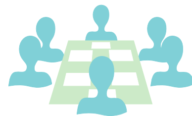
Board of Directors