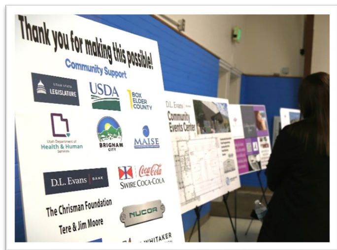
Participating organizations displayed "Dream Boards" with plans and events for the new community center.

From the moment the Boys and Girls Club of Northern Utah received keys to the building, many other nonprofit organizations were equally excited, as they had the opportunity to bring their organizations to the center. This provides vital services for all people looking for