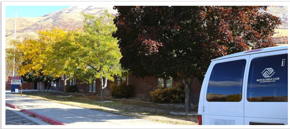
This repurposed elementary school in Brigham City provides a place for youth activities and office space for over a dozen nonprofit organizations.

BRIGHAM CITY, UTAH – What had been the vacant former old schoolhouse of Mountain View Elementary now has new life. The display on the message board proudly states, “Welcome to the Boys and Girls Club.”