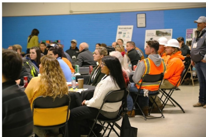
Community Members, contractors, and volunteers all join to celebrate the Boys and Girls Club Community Center Open house

As others stood to speak of their gratitude – from congressional leaders to contractors – many reflected on their own experience as children in the Boys and Girls Club, and the impact it made on their lives.