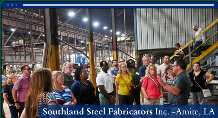
Southland Steel Fabricators Inc. -Amite, LA