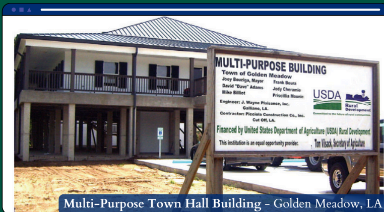
Multi-Purpose Town Hall Building - Golden Meadow, LA