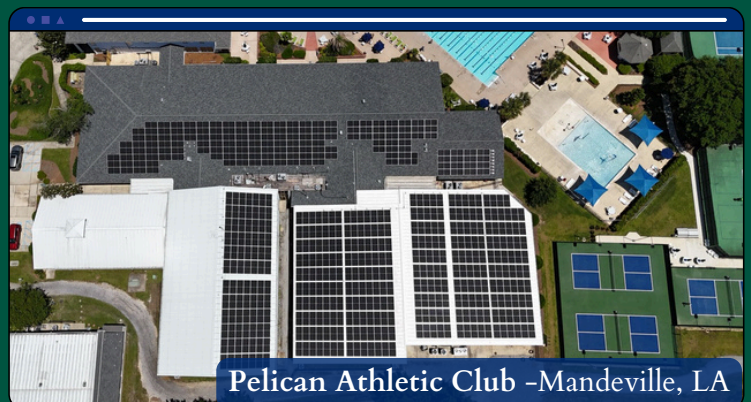
Pelican Athletic Club -Mandeville, LA