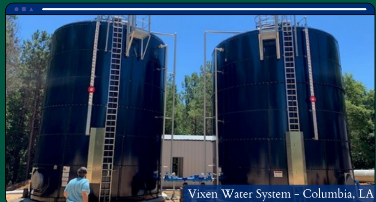
Vixen Water System - Columbia, LA