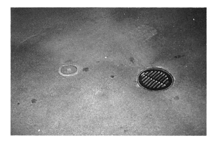
Note 1—Floor drains come in various shapes and sizes. Shown here is one type of floor drain. It is important to know the point of discharge of any floor drain.