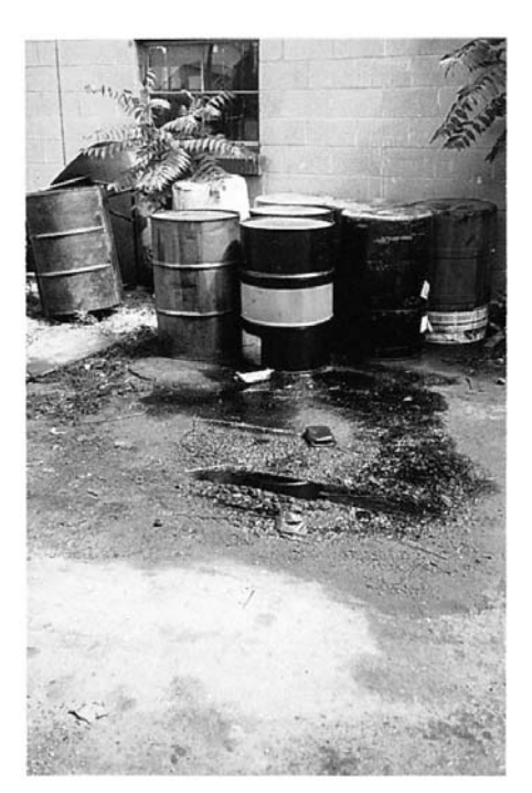
FIG. X1.12 Surface Staining from Improper Drum Storage

ASTM International takes no position respecting the validity of any patent rights asserted in connection with any item mentioned in this standard. Users of this standard are expressly advised that determination of the validity of any such patent rights, and the risk of infringement of such rights, are entirely their own responsibility.