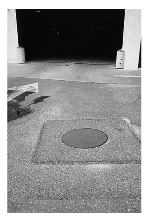
Note 1—Oil-water separators are often located under manholes outside repair garages, or at any location where it is necessary to separate oil from water prior to discharge.