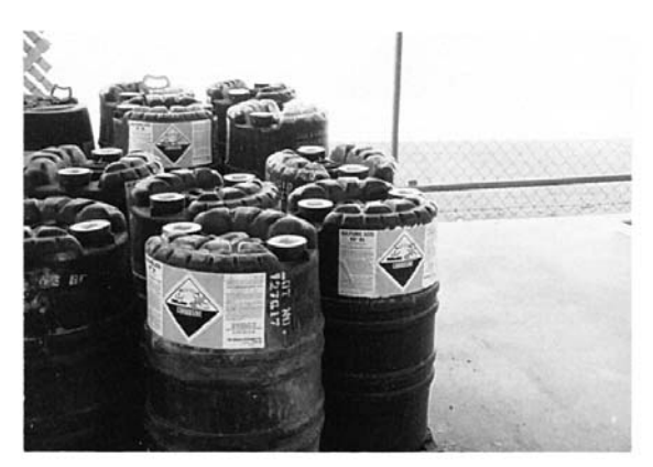
FIG. X1.2 Chemical Storage in 55-gal (208-L) Plastic Drums