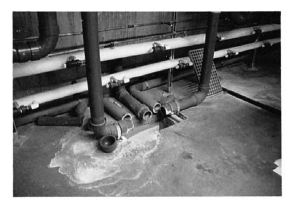
Note 1—Floor drains come in various shapes and sizes. Shown here is one type of floor drain. It is important to know the point of discharge of any floor drain.