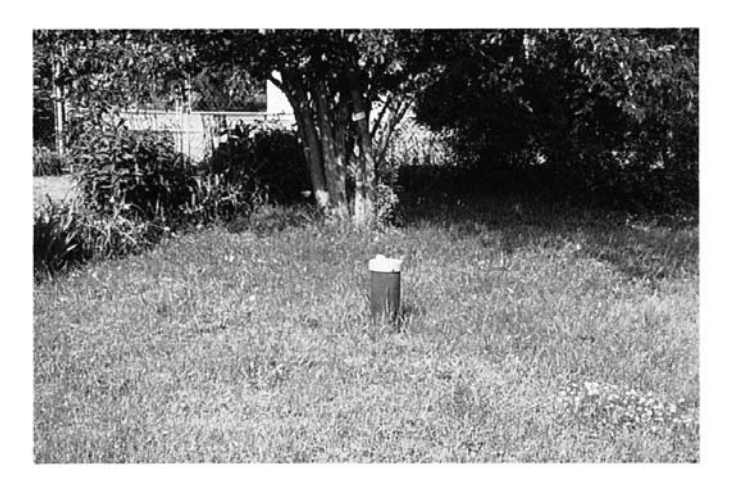
Note 1—Approximately 8-in. (203-mm) diameter. FIG. X1.10 Water Supply Well for Residential Property