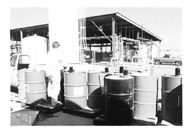
FIG. X1.1 Chemical Storage in 55-gal (208-L) Steel Drums