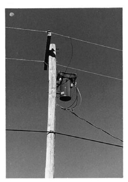
FIG. X1.3 Typical Pole-Mounted Transformer