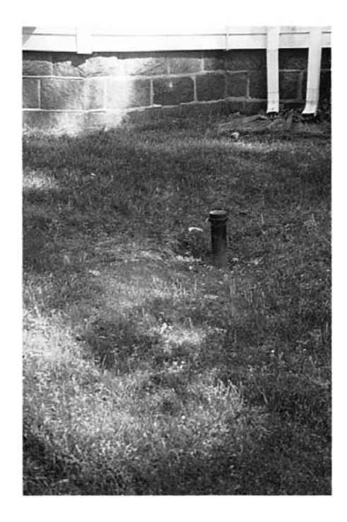
Note 1—Approximately 2½-in. (64-mm) diameter with screw cap. FIG. X1.9 Fill Pipe for Residential Underground Fuel Oil Storage Tank