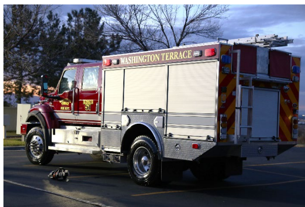
New Washington Terrace City Fire Engine

USDA Rural Development, Community Facilities Programs offer direct loans, loan guarantees and grants to develop or improve essential public services and facilities in communities across rural America. These amenities help increase the competitiveness of rural communities in attracting and retaining businesses that provide employment and services for their residents. To apply, contact your local Rural Development Utah office, or visit https://www.rd.usda.gov/ut for more information.