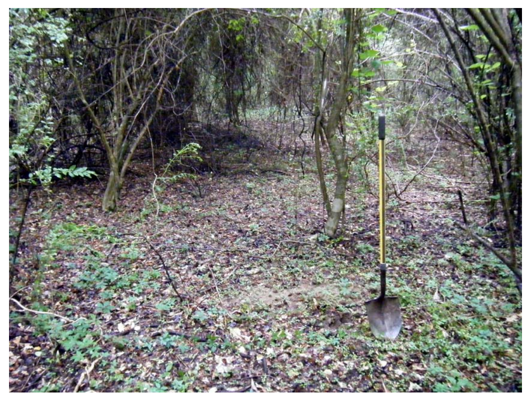
Figure 9. 22It710, view to the east.