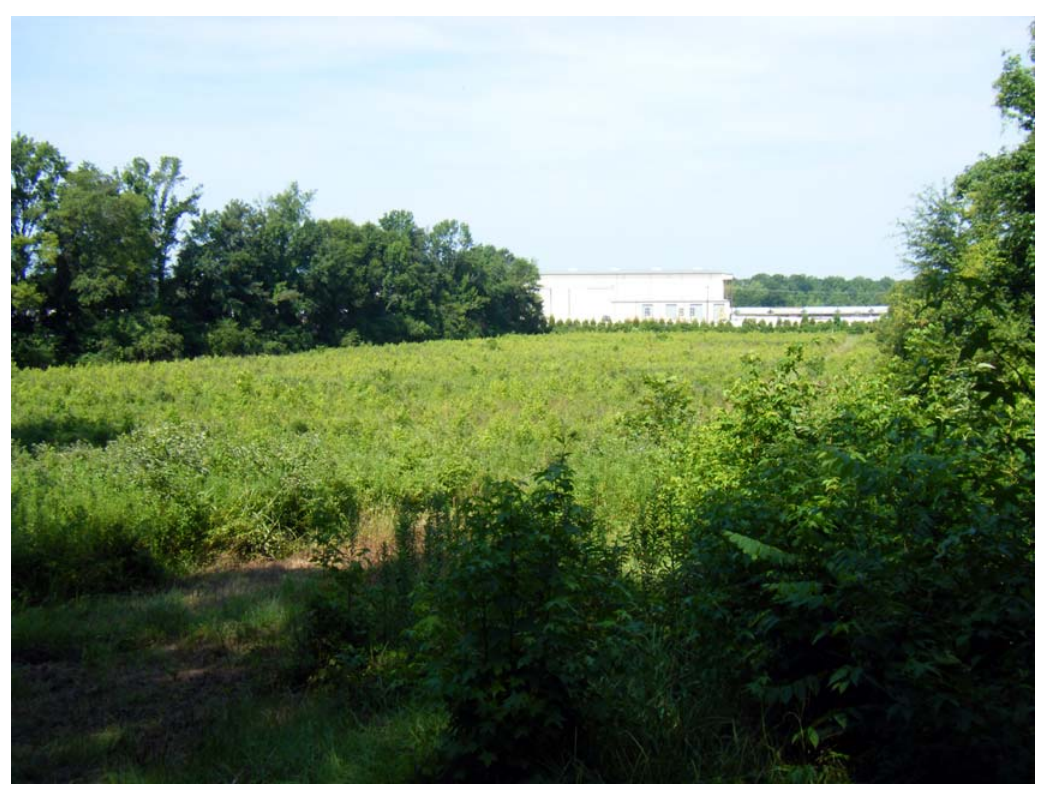
Figure 4. Flood plain ground cover in the southern third of the survey area, view to the west.