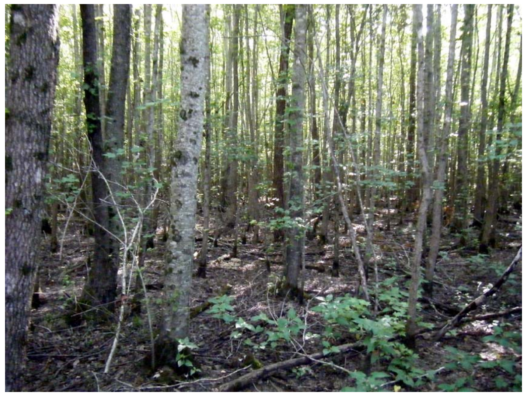
Figure 2. Flood plain tree cover in the northern two thirds of the survey area, view to the east.