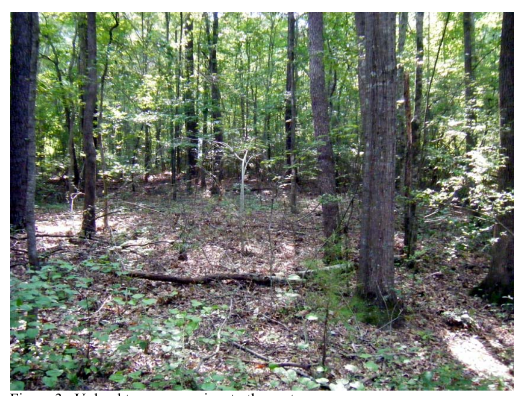
Figure 3. Upland tree cover, view to the east.