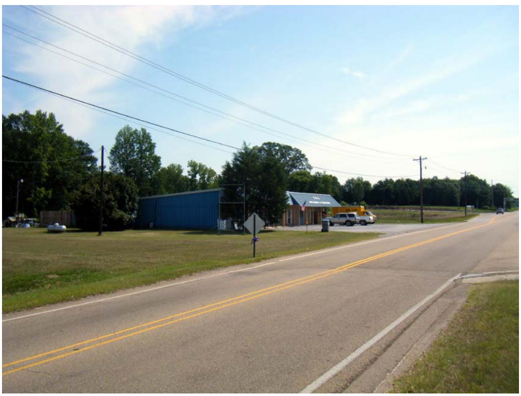
Figure 5. Standing structure, southern end of the survey area, view to the northeast.