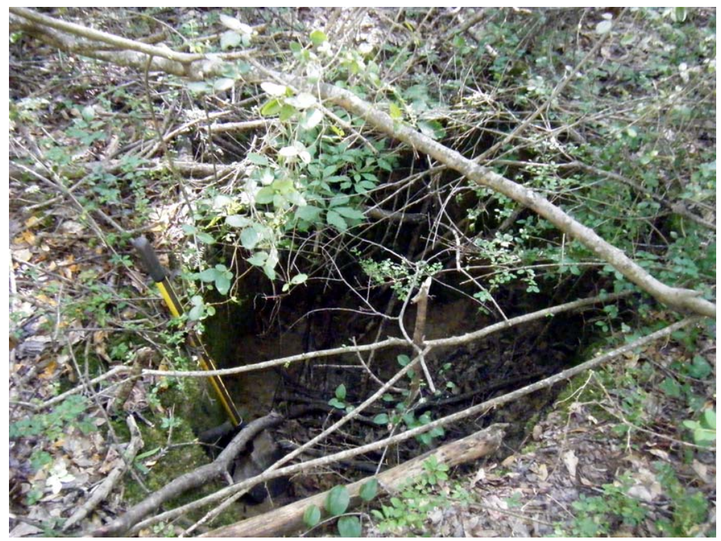
Figure 8. Possible cistern, 22It709, view to the west.