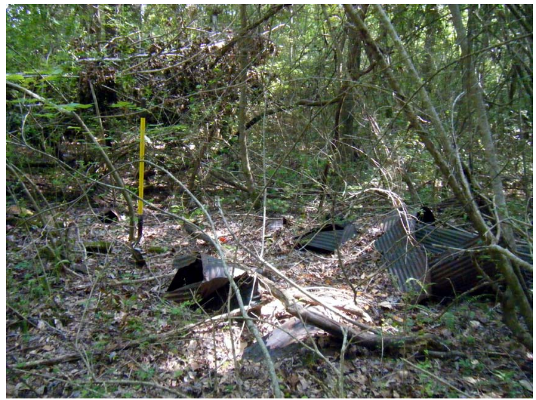
Figure 7. Roofing tin and chimney fall, 22It709, view to the northwest...