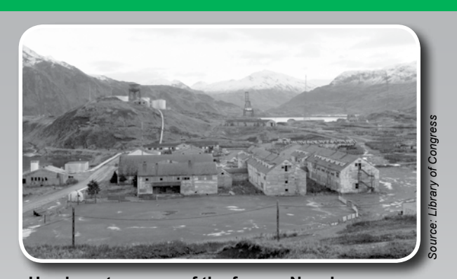
Headquarters area of the former Naval Operating Base at Dutch Harbor, Unalaska Island, Alaska