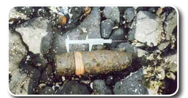
An example of a medium caliber munition

Because explosive hazards associated with military munitions from past military activities may remain on and in the surrounding waters of Range Complex No. 1, the U.S. Army Corps of Engineers recommends that landowners and visitors follow the 3Rs of Explosives Safety – Recognize, Retreat and Report.