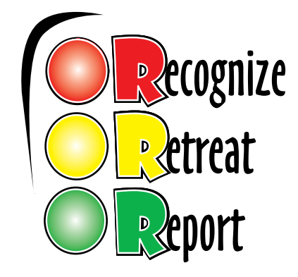
Visit the U.S. Army's Explosives Safety Education website: 3Rs.mil